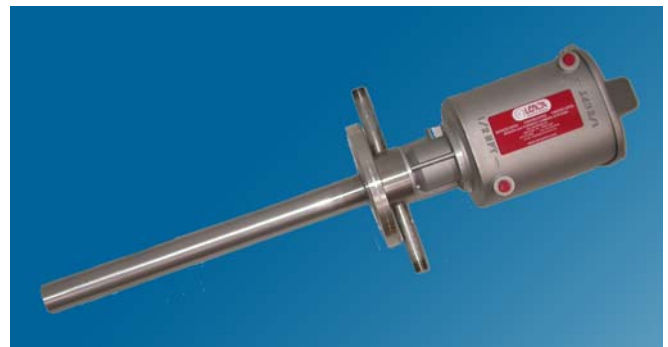
Model 6555FC Series

Lenox FireSight furnace camera systems consist of a high-resolution (540 line), color CCD camera and sophisticated light volume control, a Lenox exclusive that allows an operator to remotely adjust the amount of light transmitted to the camera eliminating the flaring / blooming common with other systems. Quartz optics, another Lenox exclusive, are used and can withstand temperatures up to 1200°F (649°C) higher than the glass lens used in other systems. In addition, a water-cooled lens jacket and CCTV camera housing provides cooling and protection for the furnace camera and air-purging of the lens system to prevent fouling by deposition. Designed to be mounted directly through the furnace wall these furnace cameras can be used in applications up to 3500°F (1927°C). Available with either a 24" (610mm) or 36" (914mm) lens in either direct (60° or 90°) or right-angle (55°) view configurations. Special lengths up to 126 inches (329cm) are available.