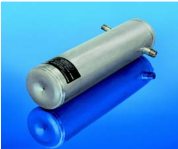
Model 6900SC Series

Lenox / Pultz high-temperature, video furnace camera systems are designed to be mounted either directly through the wall or flush with the exterior wall of a furnace. The stainless steel camera housing employs a steel triple wall laminar flow for efficient water-cooling of the color CCD camera and PH lens technology to provide clear, real time high-resolution (540 line) images, enabling operation in hostile environments up to 4250°F (2345°C). An integral air-purge prevents fouling of the lens system. The furnace camera is available in lengths of 18" (457mm), 24" (598mm), 31" (762mm) and provides direct viewing with a choice of 30°, 45°, 90° field of view and zoom capabilities up to 5X.