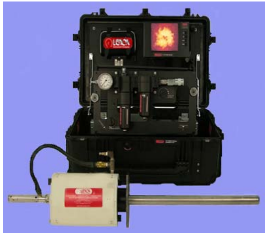
Model 6515FDC Portable Diagnostic Series

Optional fixed system accessories include an Automatic Retract System that automatically pulls the Lenox boiler camera back should a loss of cooling occur, preventing possible over - temperature damage to the furnace lens assembly; a high efficiency compressed Air Filter System for removing oil, water and particulates providing clean air to the FireSight system insuring trouble- free performance and a clear view of the combustion. It uses a self-purging coalescing filter and a pressure differential switch, which may be wired to an alarm, letting the operator know when its time to change the filter elements. Flat CRT or Flat LCD monitors and a Digital Video Recorder are also available.