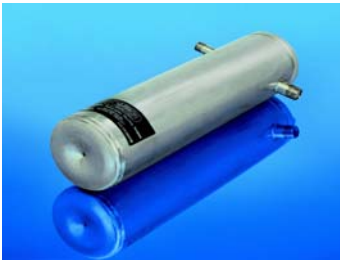
Model 6900SC Series

Lenox / Pultz high-temperature, video furnace camera systems are designed to be mounted either directly through the wall or flush with the exterior wall of a furnace. The stainless steel camera housing employs a steel triple wall laminar flow for efficient water-cooling of the color CCD camera and PH lens technology to provide clear, real time high-resolution (540 line) images, enabling operation in hostile environments up to 4250°F (2345°C). An integral air/gas-purge prevents fouling of the lens system. The furnace camera is available in lengths of 18" (457mm), 24" (598mm), 31" (762mm) and provides direct viewing with a choice of 30°, 45°, 90° field of view and zoom capabilities up to 5X.