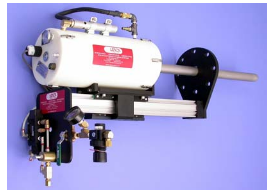
Model 6515FC Fixed Series

Fixed and portable Lenox FireSight Boiler Camera Systems are designed for applications up to 3000°F (1649°C) and require a boiler wall penetration of only 2-3/8 in. (61mm). With its small size, the system will normally fit between boiler tubes and can often be used with existing wall penetrations. Lenox FireSight Systems consist of a high- resolution (540 line), color CCD camera and sophisticated light volume control, a Lenox exclusive that allows an operator to remotely adjust the amount of light transmitted to the camera eliminating the flaring / blooming common with other systems. Quartz optics, another Lenox exclusive, are used and can withstand temperatures up to 1200°F (649°C) higher than the glass lens used in other systems. The compressed air-cooling system provides reliable performance while using considerably less air than competing systems. The fixed system Wall Box mounting assembly provides a protective housing for the system and serves as the primary coolant shroud.