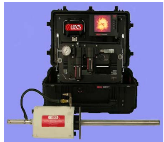
Model 6515FDC Portable Diagnostic Series

Optional fixed system accessories include an Automatic Retract System that automatically pulls the Lenox boiler camera back should a loss of cooling occur, preventing possible over - temperature damage to the furnace lens assembly; a high efficiency compressed Air Filter System for removing oil, water and particulates providing clean air to the FireSight system insuring trouble- free performance and a clear view of the combustion. It uses a self-purging coalescing filter and a pressure differential switch, which may be wired to an alarm, letting the operator know when its time to change the filter elements. Flat CRT or Flat LCD monitors and a Digital Video Recorder are also available.