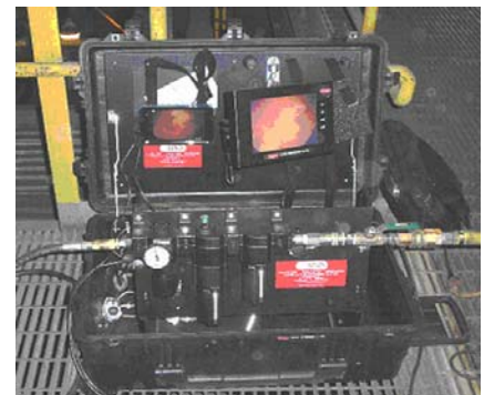
Model 6515FDC Series Portable Kiln Camera Diagnostic System

Please contact us for more information about our products and capabilities and to discuss your specific application.