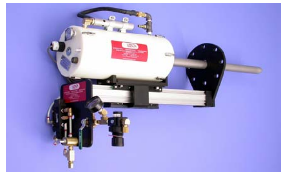
Model 6515FC Series Mounted on Automatic Retract