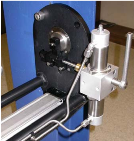
Automatic Baffle Assembly in closed position. Handle at right is for manual operation.