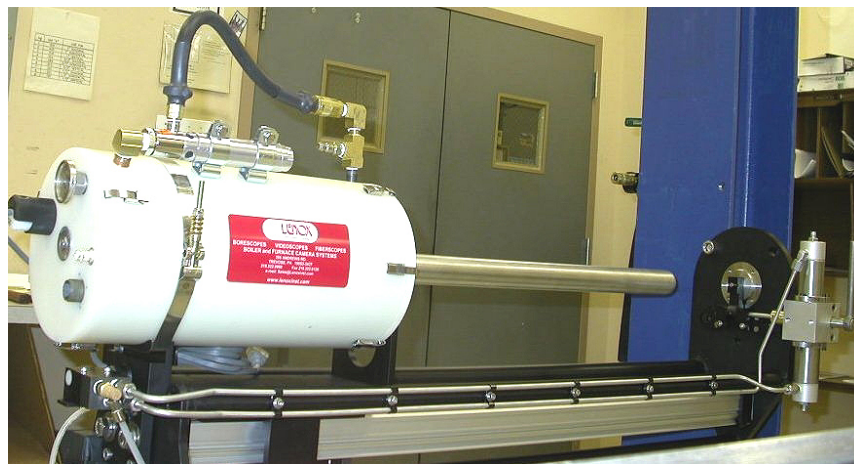
The FireSight Camera mounted on an Automatic Retract System is retracted and the Baffle is closed.

The Lenox Automatic Baffle Assembly (p/n 350-0200/C) can be used with a Lenox Automatic Retract System . When loss of plant compressed air pressure occurs the FireSight Camera must be removed in order to prevent damage to its lens assembly. Boilers/Furnaces operating under positive pressure necessitate that the viewing port be sealed upon the removal of the FireSight Camera to prevent dangerous hot gases from escaping. Lenox designed the Automatic Retract System with Baffle Assembly to pneumatically operate the baffle and retract simultaneously. The pneumatic logic allows the device to be synchronized such that when the FireSight Camera is retracted, the baffle will close and then will open again when the FireSight Camera is re-inserted. This sequence is initiated upon loss of compressed air to the system. Once air pressure is re-established the FireSight Camera re-inserts automatically.